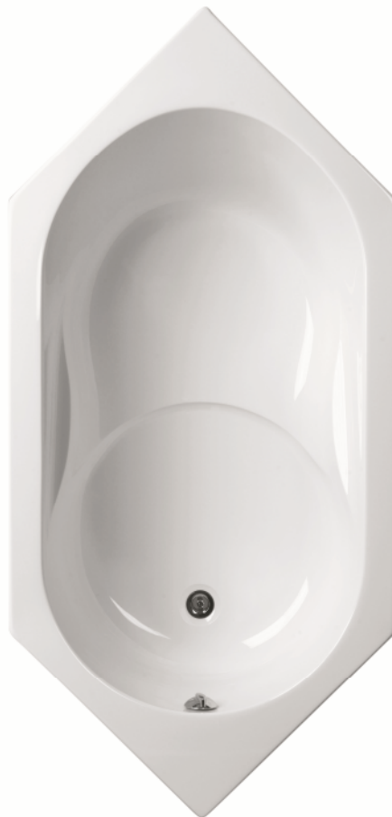
Diamond til indmuring/indbygning